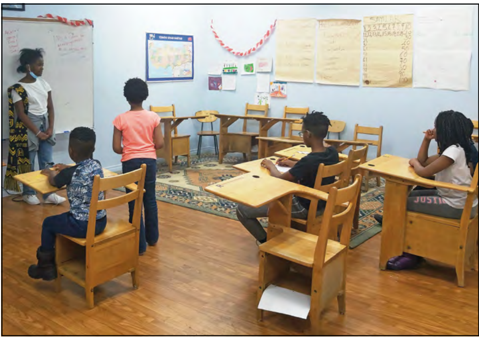
Children discovering in the new classroom.

activities and through the grant much needed renovations were completed and BCCA moved into the building in early 2022. It’s a win-win situation with the renovated office space gained and the many future intercultural exchanges bound to happen between these two newcomer communities. Earlier in March, while the Burundian Canadians were preparing savoury treats for an upcoming Women’s Day Celebration, TCS Vice-President Sim Senol taught Turkish games to the Burundian Children. Community members living in or passing by the Canora neighbourhood have probably witnessed some of the other changes happening in the block where the Turkish Canadian Society of Edmonton is located. TCS has raised more than $630,000 during the pandemic and completed about 50% of the construction of a small mosque on the west side of its property. Earlier in