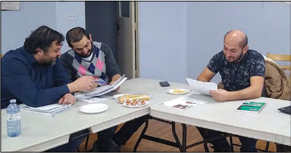
Community members planning.