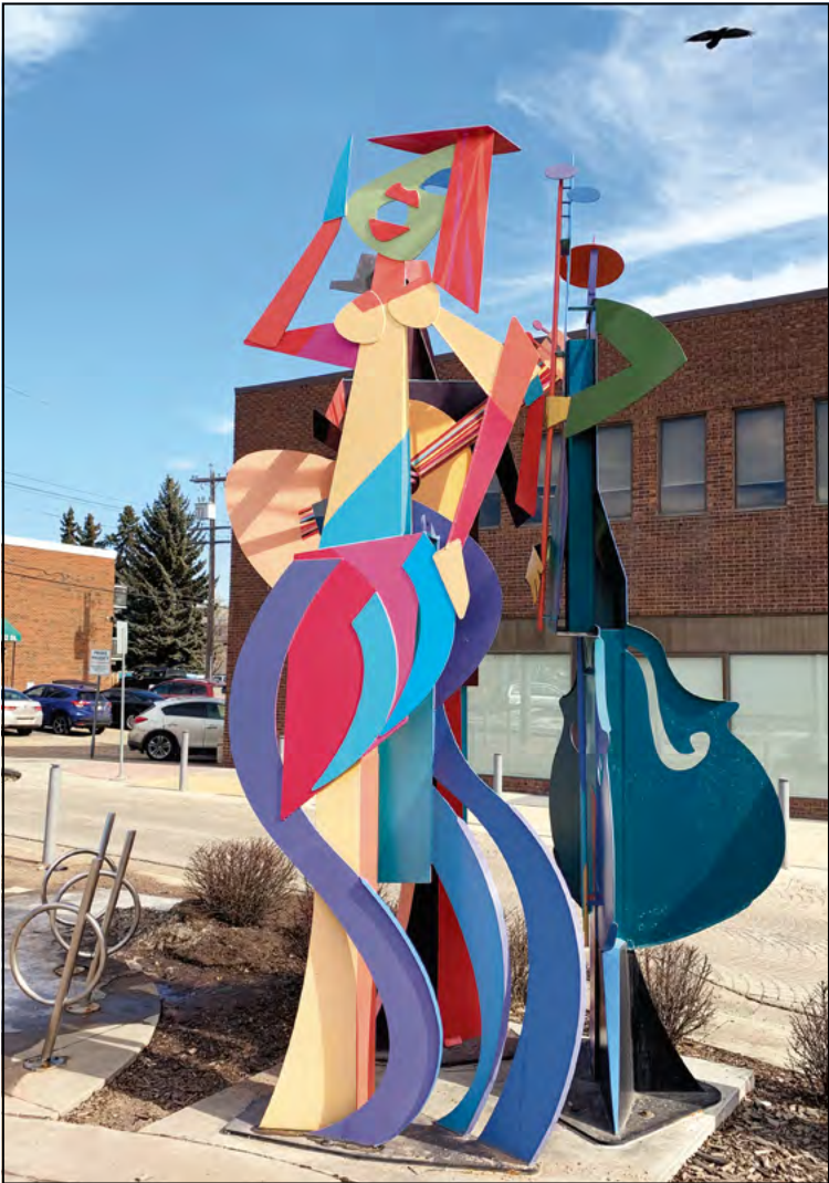
Trio (2015) by Bella Totino-Busby & Verne Busby Bright, accessible, and whimsical, Trio provides a colourful and human-scale counterpoint to the hustle and bustle of Stony Plain Road. The design lends a sense of vitality to its site yearround – animating sunny summer afternoons, and enlivening the grey and rainy weekends. The musicians symbolize the connective power of music – a common language throughout the world – and portray the sense of community fostered within the neighbourhoods surrounding this busy artery.