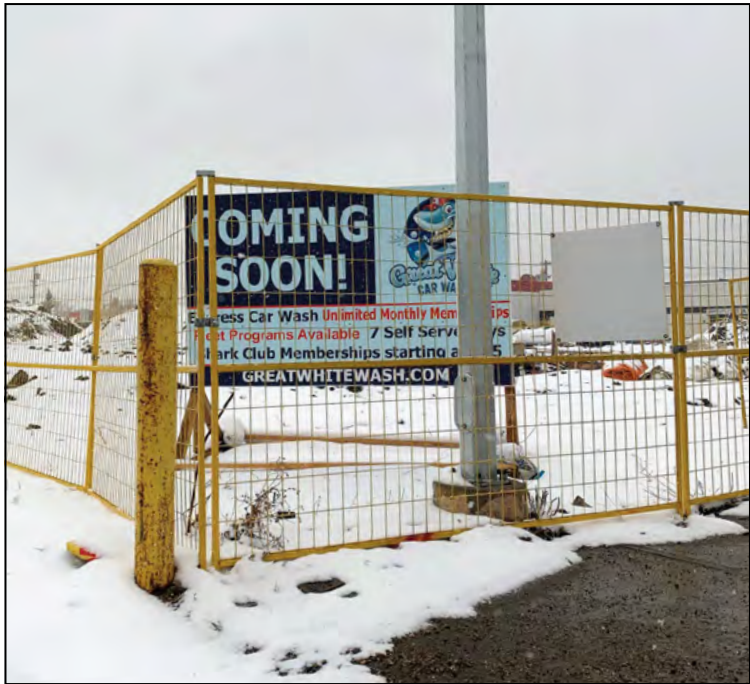
A new business coming to 100 Avenue and 169 Street. This new build will be a destination business for many including large trucks and RVs.