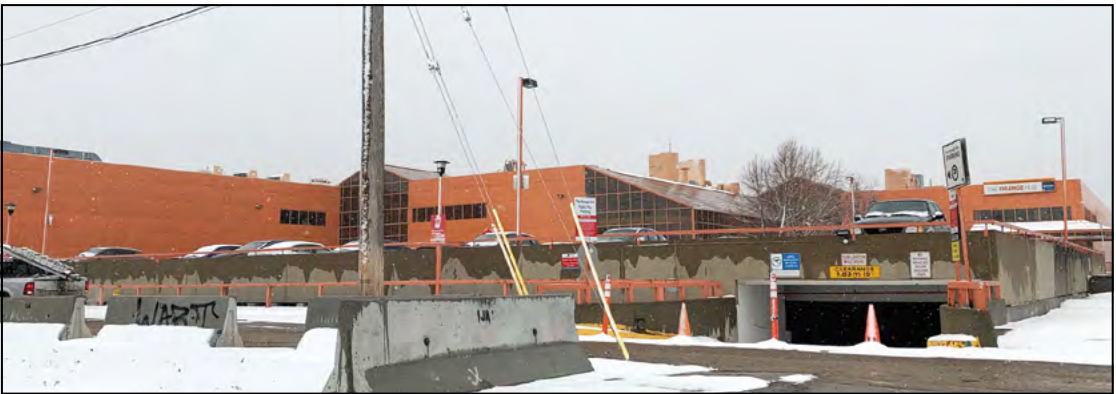
Above: The old Orange Hub parking structure. (See “Major Changes Coming” p.3) Below: Property redevelopment on SPR and 160 Street. This old property has been rejuvenated for new businesses.

Send in photos to spanneditor@gmail.com . All ages and skill levels are welcome! Have your snapshots featured in the next issue of SPANN!