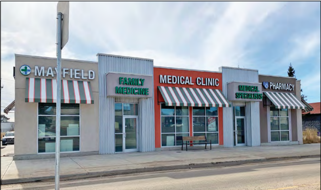
Some of the new Businesses opening within Stony Plain Road BIA. Our Business District has seen an increase in new businesses since the beginning of the pandemic.